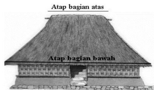
Figure 1. Bumbungan

The lower part of the roof has a length of 5,2, while the upper part of 5/13 of the lower part. The height of the roof is about 3/2 of the top. So, what is the perimeter of the house roof?